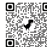
Campus Shuttle Bus