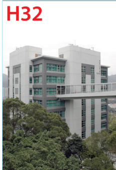
H32 蒙民偉工程學大樓 William M.W. Mong Engineering Building (ERB)