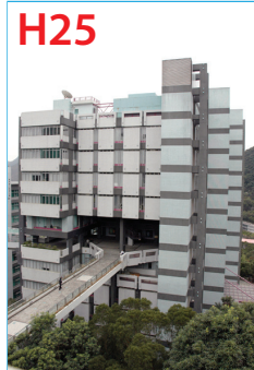
H25 何善衡工程學大樓 Ho Sin Hang Engineering Building (SHB)