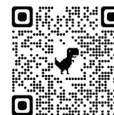
CUHK Campus Map

Follow Chung Chi Road, it takes about 15-minute walk uphill from the University MTR Station.