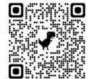
Campus Shuttle Bus