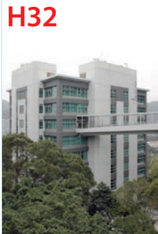
H32 蒙民偉工程學大樓 William M.W. Mong Engineering Building (ERB)