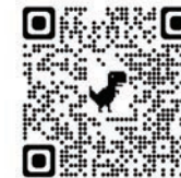
CUHK Campus Map

Follow Chung Chi Road, it takes about 15-minute walk uphill from the University MTR Station.