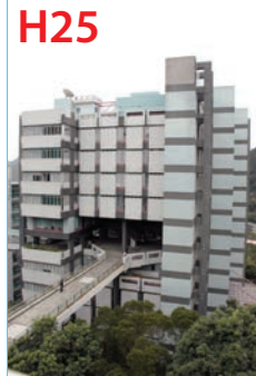
H25 何善衡工程學大樓 Ho Sin Hang Engineering Building (SHB)